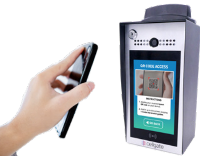
QR CODE VISITOR MANAGEMENT