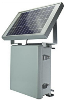
Solar Power Kit